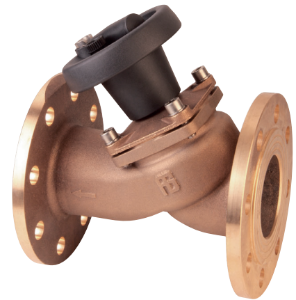
Tabella flange a pag. 195 Flange table on page 195